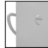
Standard Cam Latch